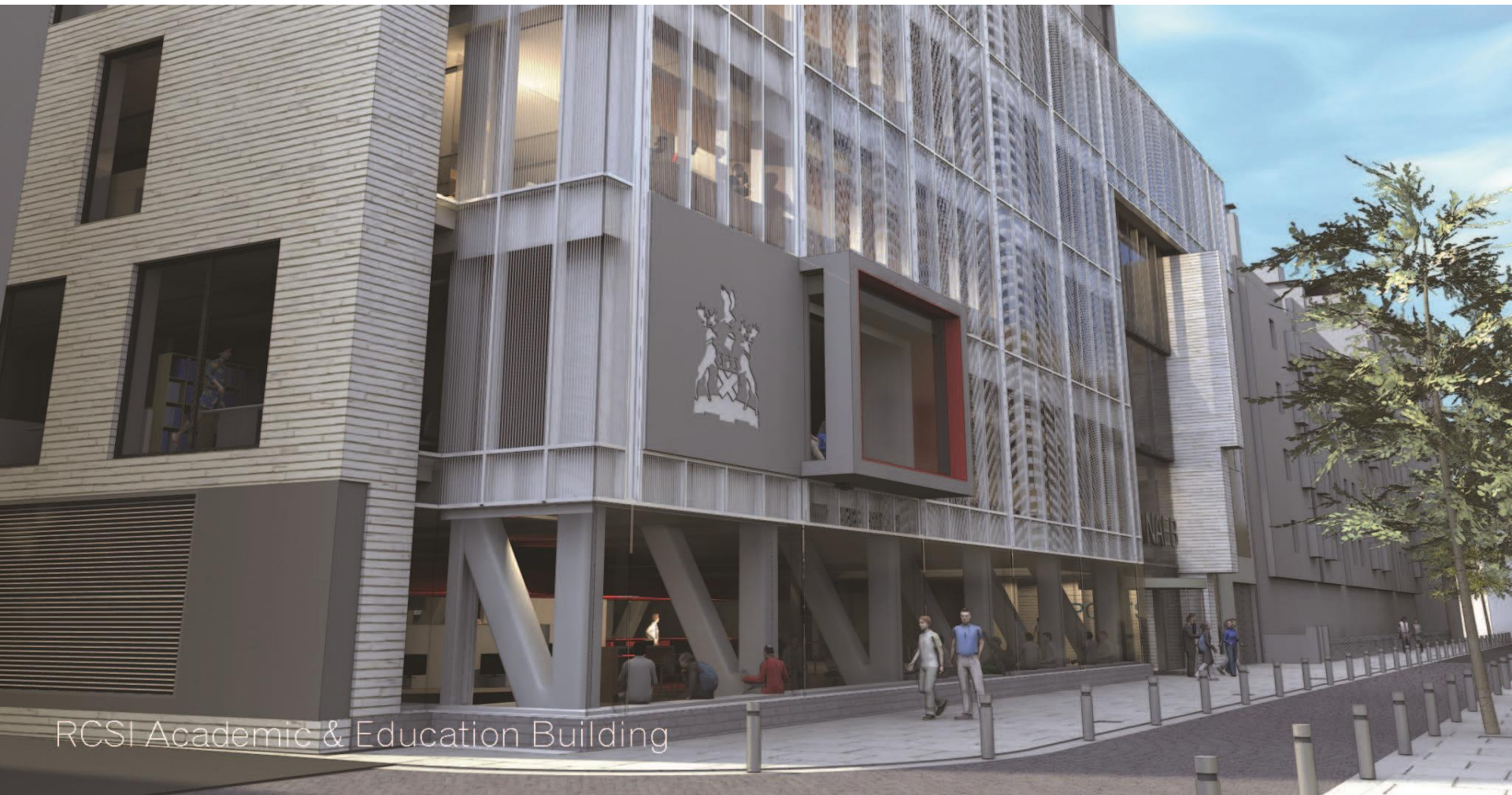
RCSI Academic & Education Building